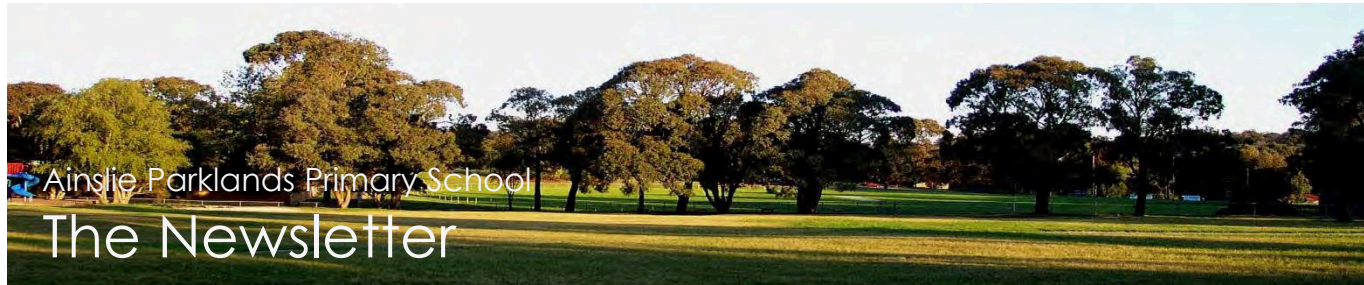
Views over Ainslie Park