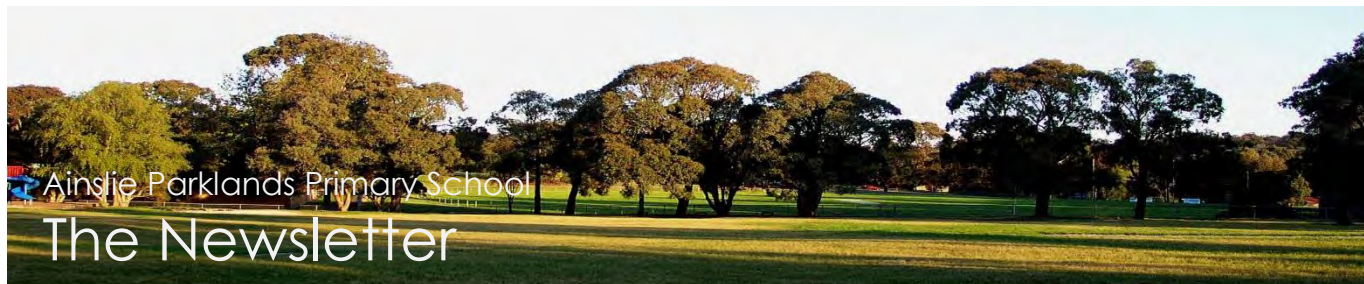
Views over Ainslie Park